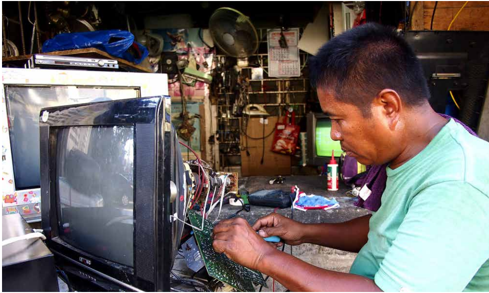
Over 400 ICT manufacturers operate in the Philippines