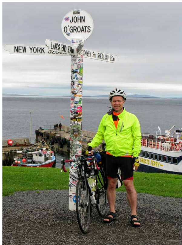
Ready for a challenge

From my experience of working at LUPC, there is a notable difference in the desire to share knowledge and promote continuous development skills. In the private sector, training is now 99% online learning whereas in the public sector there