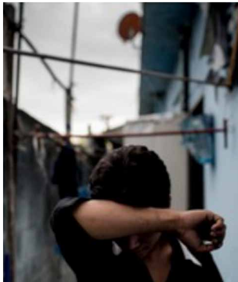
Bonded worker trapped.

The technical workshop on Health and Safety in the Electronics Industry highlighted recent health findings in the US linking high numbers of miscarriages to working in the electronics industry. Workers handling hazardous substances often fail to speak up for themselves and raise such issues. There is a pressing need to develop effective worker-driven monitoring groups to shine a light on these matters. Electronics Watch has, in conjunction with other parties, developed