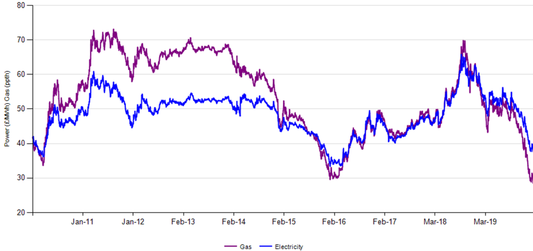
UK Gas and Electricity April Annual Prices